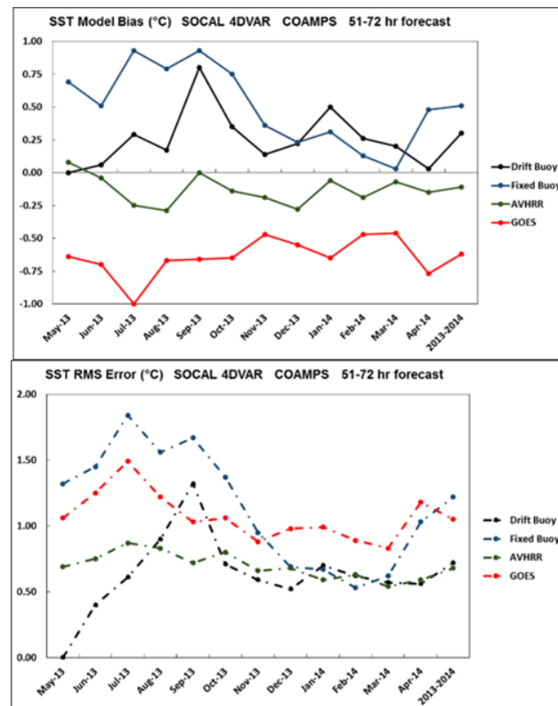
Figure 2: Monthly and annual average forecast-obs SST bias (top) and RMS errors (bottom) for the 51-72 hour forecast from the standard 4DVAR California Current experiment using unmodified NAVGEM forcing.

Figure 2 shows results of an evaluation of the monthly and annual averages of forecast-observation bias and RMS errors. Bias is small relative to AVHRR but up to 1.0°C warm relative to in situ and 1.0°C cool relative to GOES. Comparisons with GOES and fixed buoys give the largest RMS errors. The error and bias trends shown here are representative of those found in the nowcast and other forecast intervals in the various experiments run to date. Work to diagnose such discrepancies and their relation to surface forcing or assimilation continues.